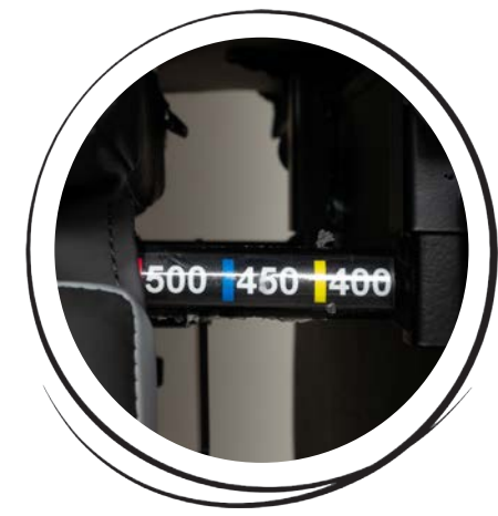
Easy and Clear Width Adjustments