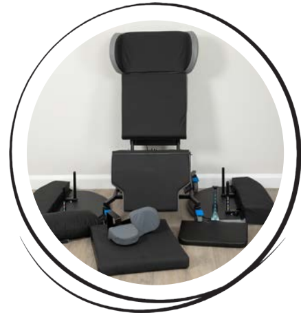
Easy to Clean and Dismantle