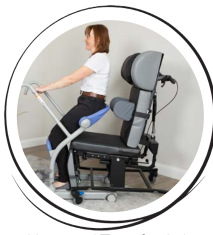
Hoist and Transfer Aid Compatible