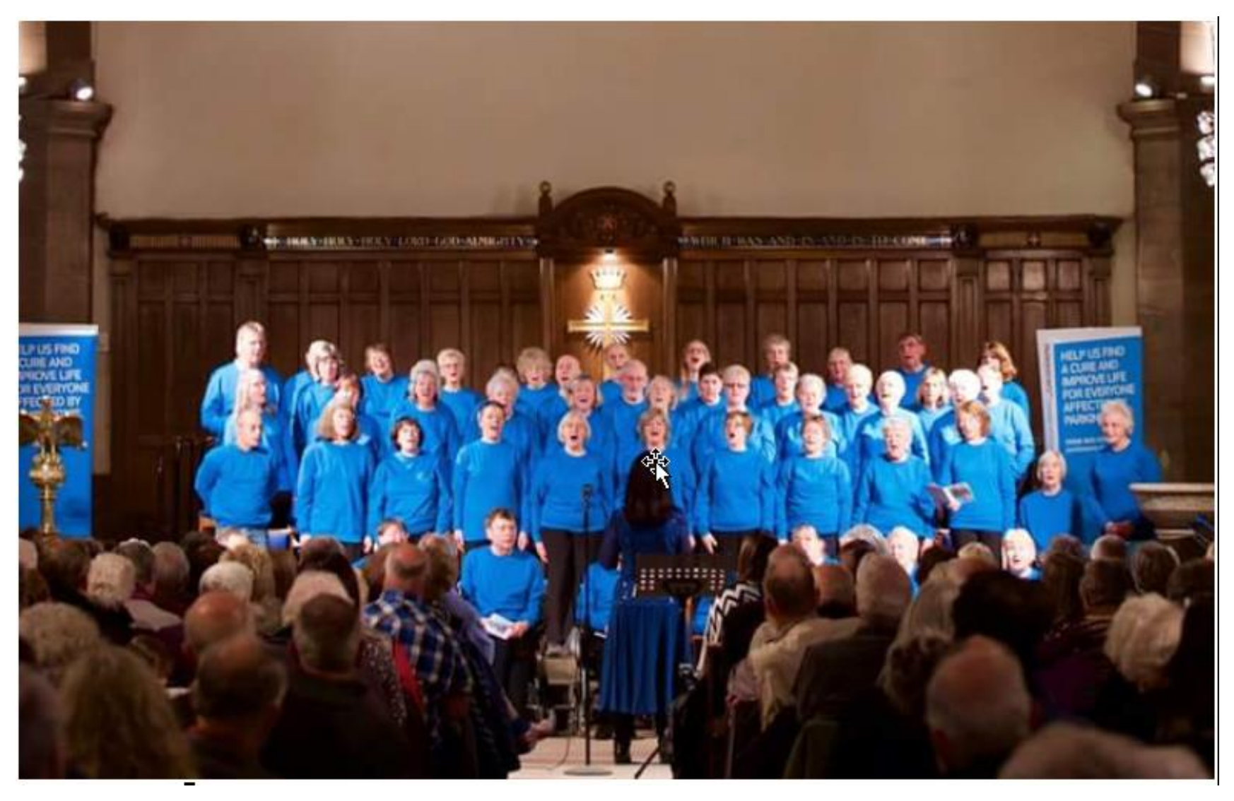
Parkinson's UK Edinburgh