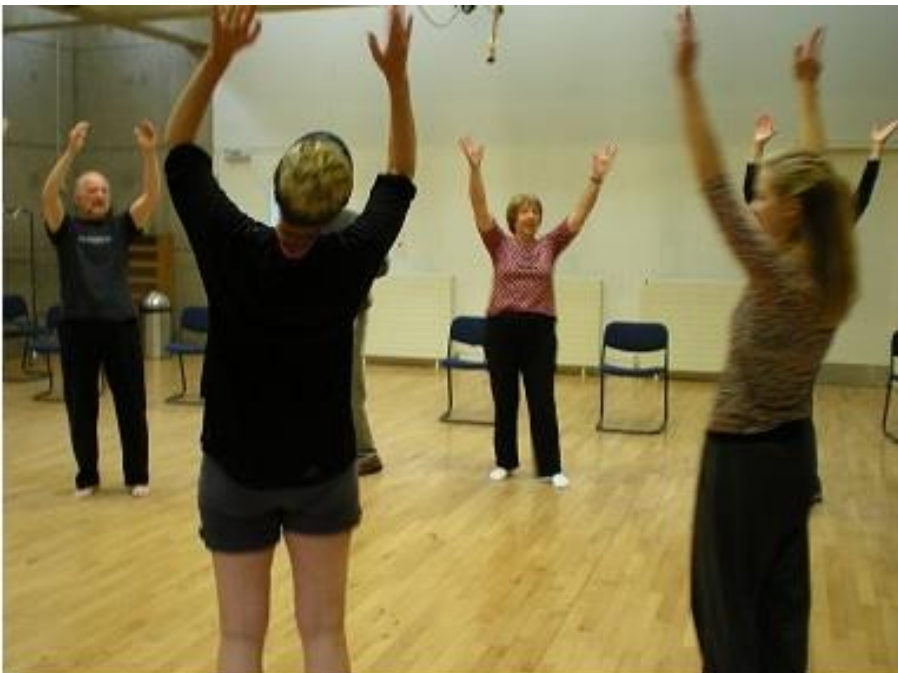
Putting together a little "Singing in the Rain" routine