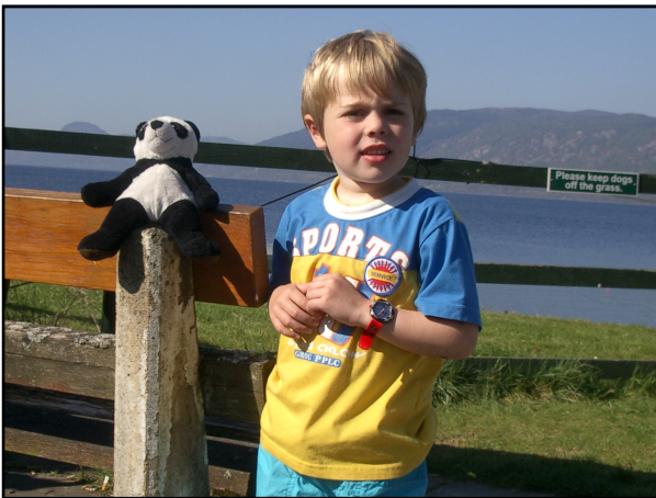
My less important disclosure ...